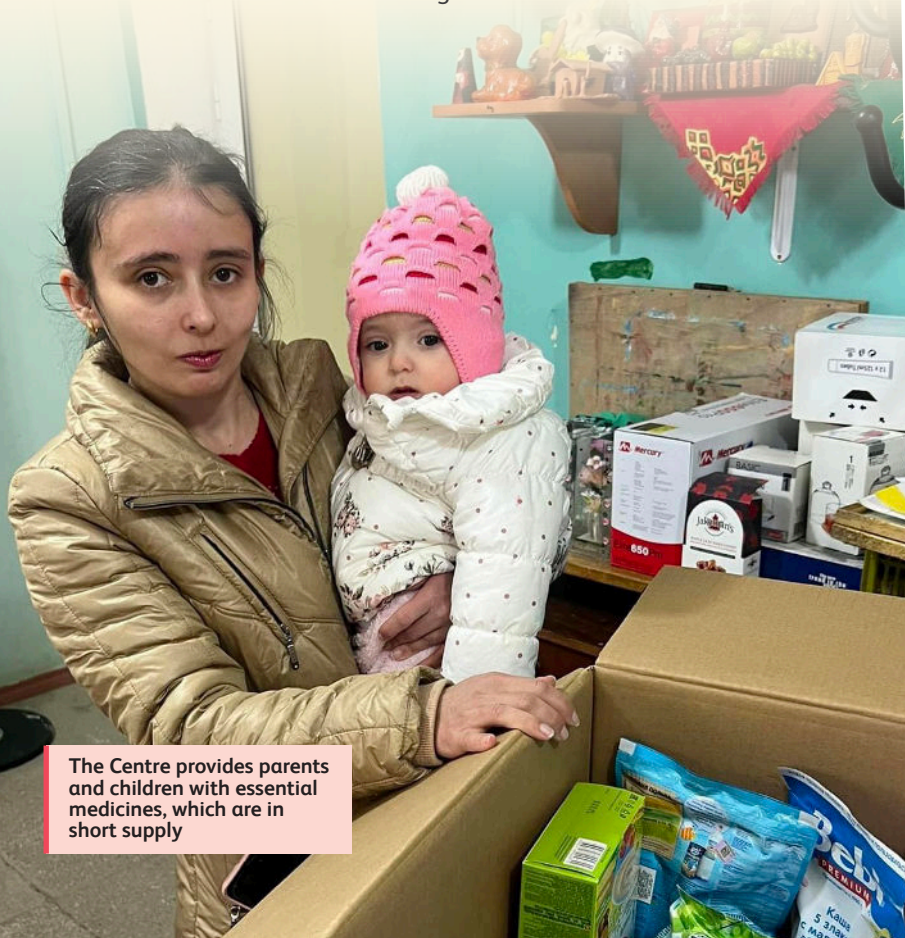
The Centre provides parents and children with essential medicines, which are in short supply

In Stepanakert and the surrounding region, demands on the Lady Cox Rehabilitation Centre have reached their highest level to date. We need your help to support our partners' life-changing work and advocate for communities living under constant threat of war.