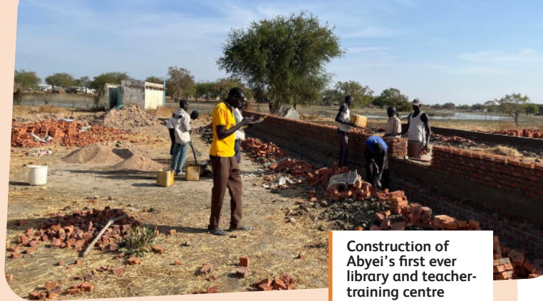
Construction of Abyei's first ever library and teacher-training centre

With the support of Guernsey Overseas Aid & Development Commission , HART and the Diocese of Abyei are constructing the region's first ever library. Once completed, the building will serve 7,855 students from seven regional schools, providing them with a safe learning space.