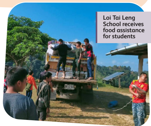
Loi Tai Leng School receives food assistance for students

Students have been provided sleeping mats and pillows, and dormitories