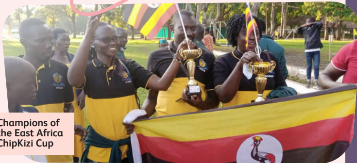
Champions of the East Africa ChipKizi Cup