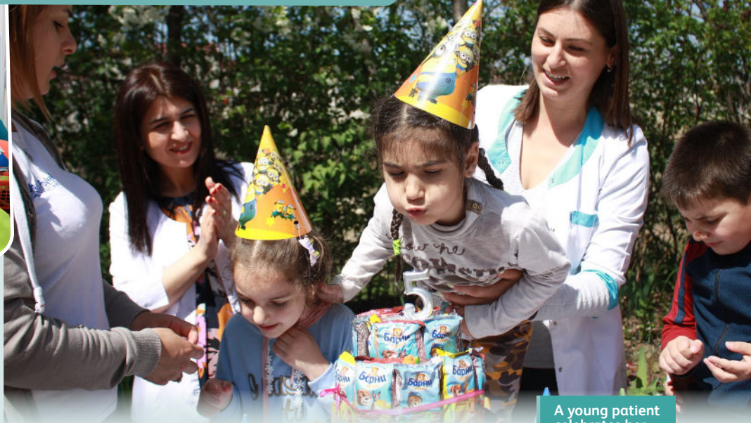
A young patient celebrates her birthday at the Centre