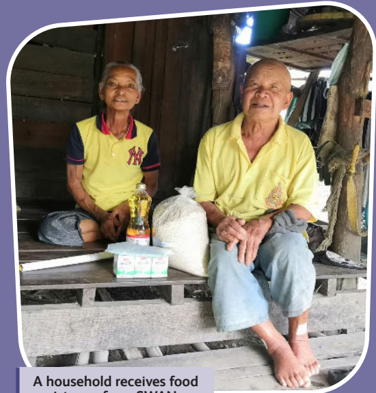
A household receives food assistance from SWAN

Subsequent fighting between the military and multiple armed ethnic groups saw thousands of people displaced across the country, with many fleeing over borders. As a result, SWAN asked HART for emergency funding to provide urgent humanitarian assistance to families who arrived at the Thai border with nothing. HART responded immediately with funding to support 800 families with items including dried food, oil, lentils, salt, face masks, antibacterial gel and hygiene kits.