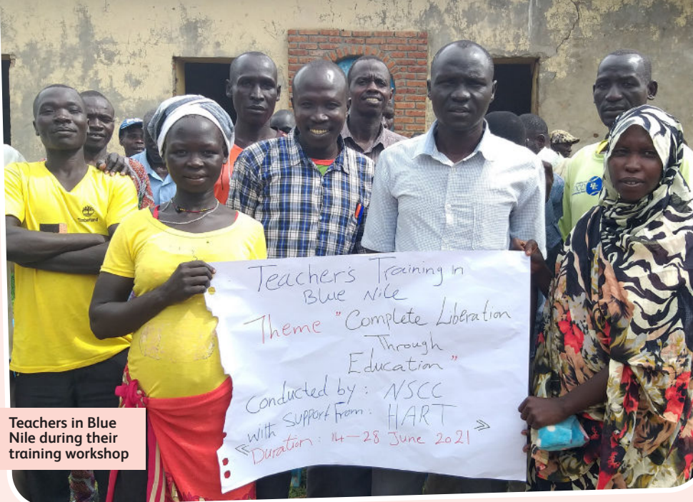
Teachers in Blue Nile during their training workshop

Of the 47 community-established primary schools in Blue Nile state, many are built out of local materials (such as wood and grass) and lack scholastic materials. There is only one qualified professional teacher in the state, who, with HART's support, studied for his qualification in Uganda in 2019.