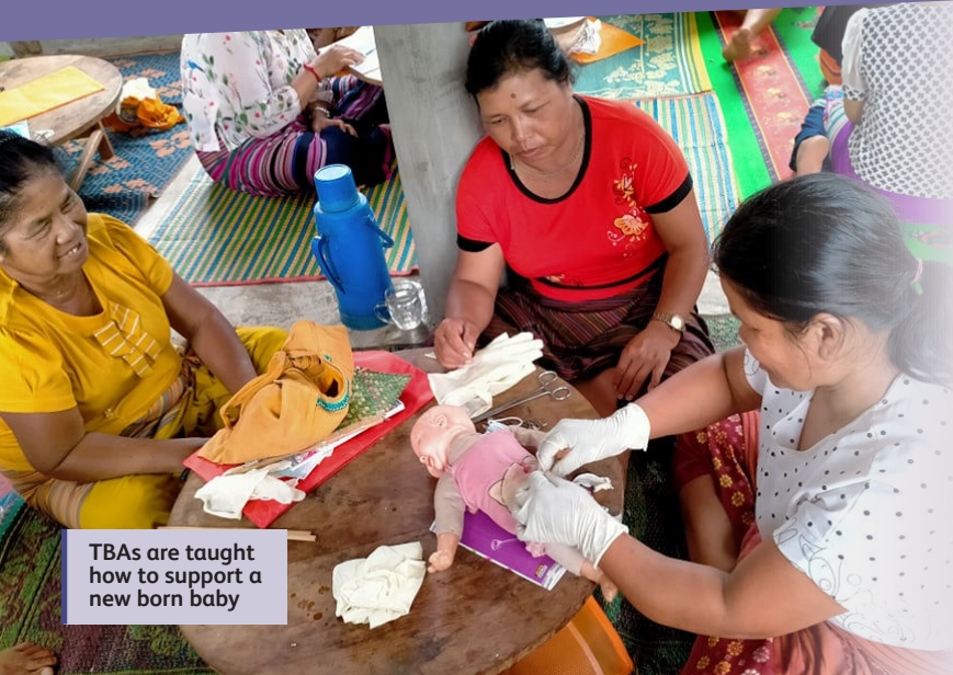
TBAs are taught how to support a new born baby