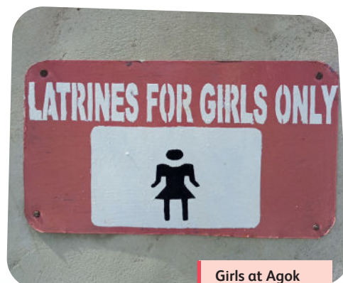
Girls at Agok School pose by their new toilet block