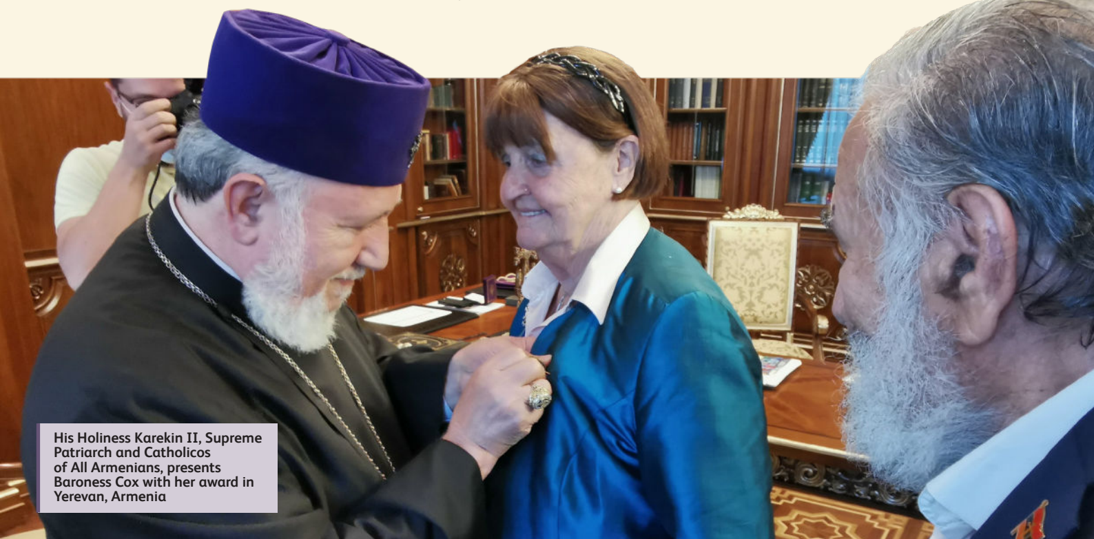
His Holiness Karekin II, Supreme Patriarch and Catholicos of All Armenians, presents Baroness Cox with her award in Yerevan, Armenia

In September, Baroness Cox travelled to Yerevan to give a lecture on 'International Religious Freedom and Peace'. She was surprised and humbled to be awarded the Order of Saints Sahak and Mesrop, the highest honour of the Apostolic Church, by His Holiness Catholicos Karekin II for her efforts in advocating for the people of Armenia and Nagorno Karabakh.