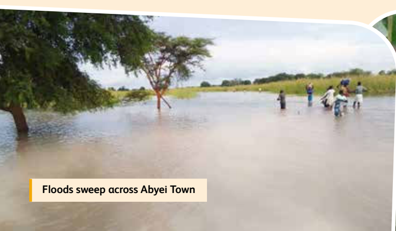
Floods sweep across Abyei Town

HART has been granted further support from Guernsey Overseas Aid & Development Commission to provide emergency relief to the most vulnerable households in five farming communities in Abyei. This will see female and child-headed households prioritised, as well as widows, the elderly, and people with disabilities.