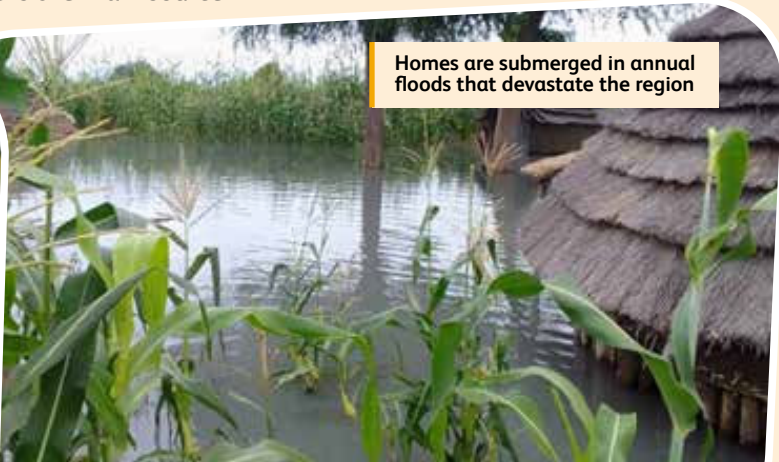
Homes are submerged in annual floods that devastate the region