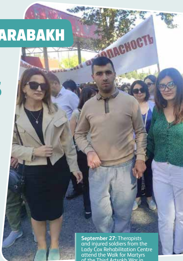
September 27: Therapists and injured soldiers from the Lady Cox Rehabilitation Centre attend the Walk for Martyrs of the Third Artsakh War in Stepanakert