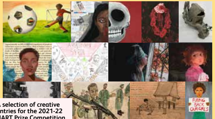
A selection of creative entries for the 2021-22 HART Prize Competition

If you know of any schools that might like to get involved, please contact office@hart-uk.org to arrange for a HART team member to visit or virtually speak at the school.