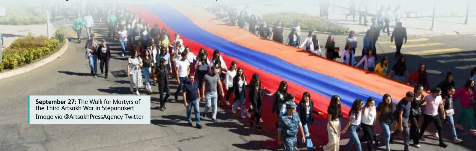
September 27: The Walk for Martyrs of the Third Artsakh War in Stepanakert