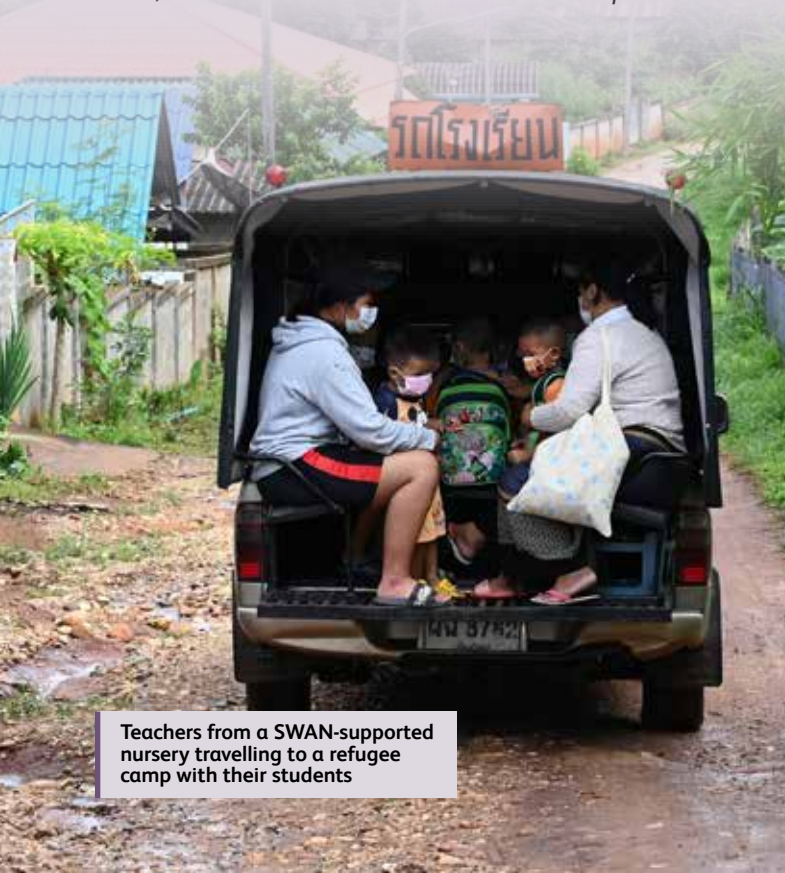
Teachers from a SWAN-supported nursery travelling to a refugee camp with their students

During the visit, HART facilitated a remote training programme for CHWs, covering the management of injuries inflicted by military offensives, including acute burns, resuscitation, triage and management of multiple casualties, acute trauma life support, vector-borne diseases, women's health, childhood nutrition, and management of health in displacement and refugee camps. SWAN's programme participants reported increased confidence in their abilities to deliver medical assistance and later conducted awareness-raising sessions, sharing what they learned with other health care providers.