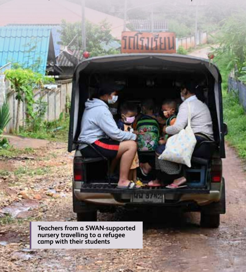
Teachers from a SWAN-supported nursery travelling to a refugee camp with their students

During the visit, HART facilitated a remote training programme for CHWs, covering the management of injuries inflicted by military offensives, including acute burns, resuscitation, triage and management of multiple casualties, acute trauma life support, vector-borne diseases, women's health, childhood nutrition, and management of health in displacement and refugee camps. SWAN's programme participants reported increased confidence in their abilities to deliver medical assistance and later conducted awareness-raising sessions, sharing what they learned with other health care providers.