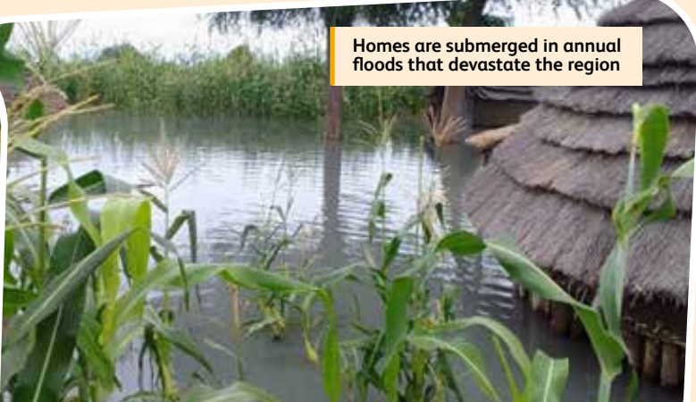
Floods sweep across Abyei Town