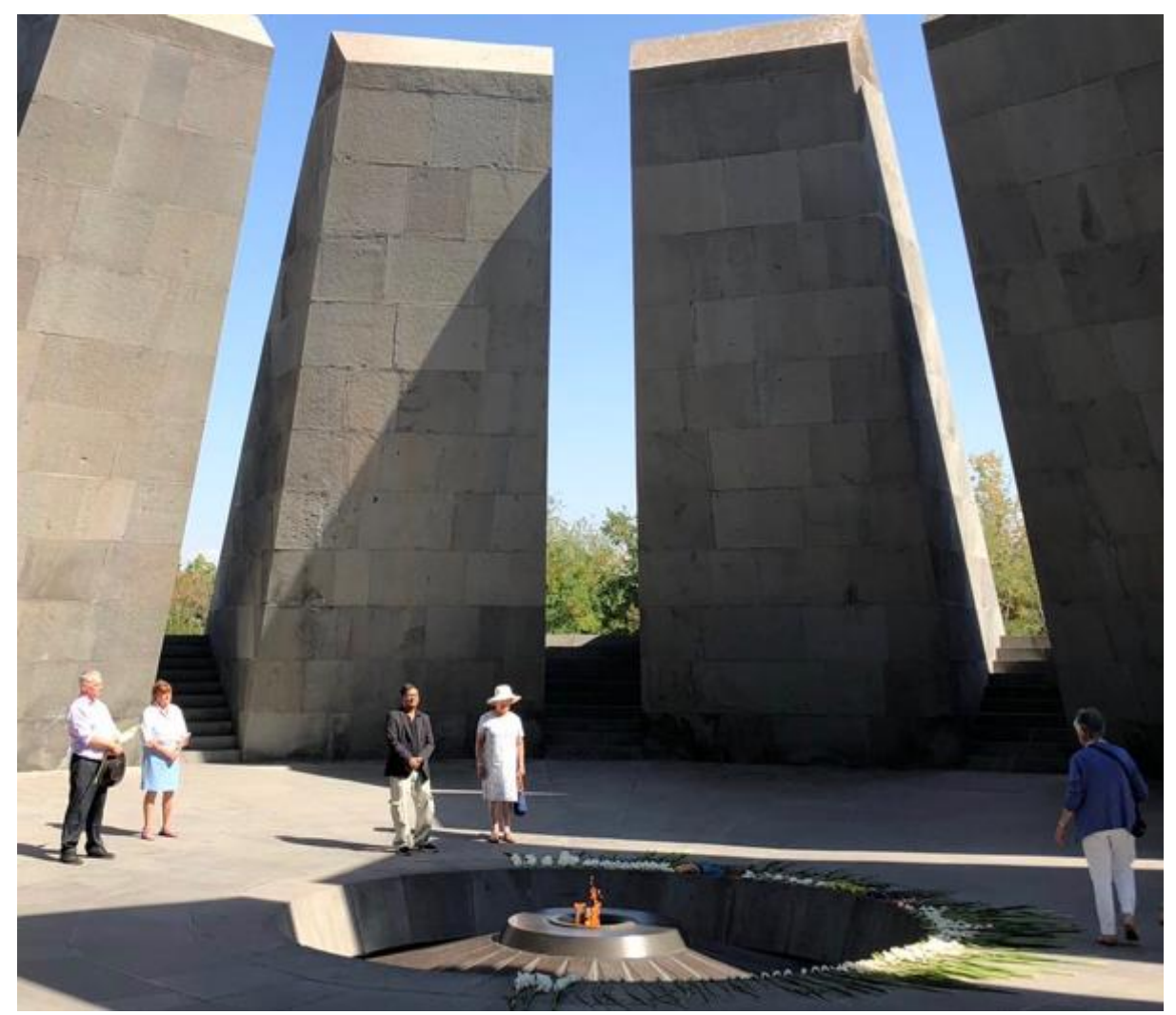
The HART team visits the Armenian Genocide Memorial