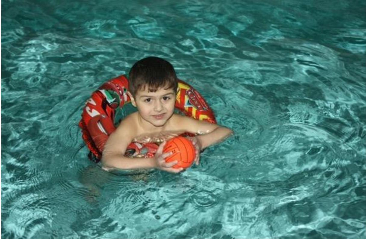
A patient receives treatment in the Centre's state-of-the-art hydrotherapy pool