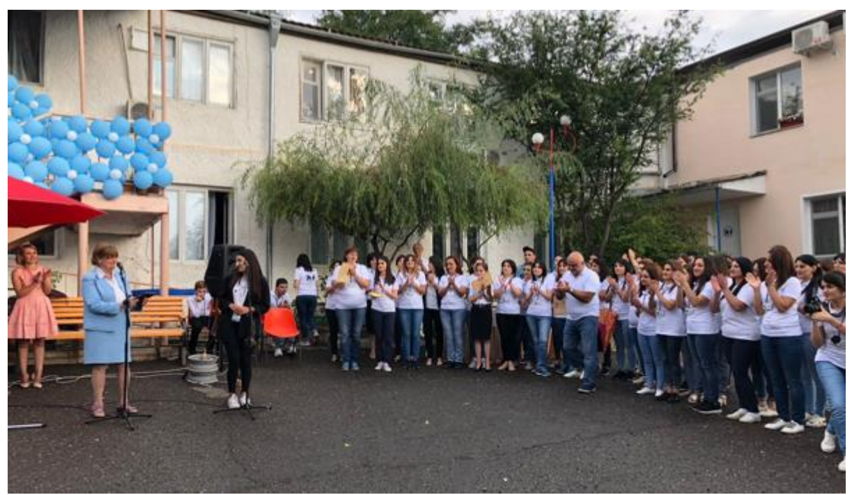
Caroline Cox, during her speech at the Rehabilitation Centre's 20th anniversary celebration, said: "I am humbled and inspired by the spirit of the Armenian people: you not only survive but you create beauty from the ashes of destruction."

The call for the recognition of statehood was unanimous in our various discussions. All of those whom we met said that international recognition of Nagorno-Karabakh is vital to moving the peace process forward.