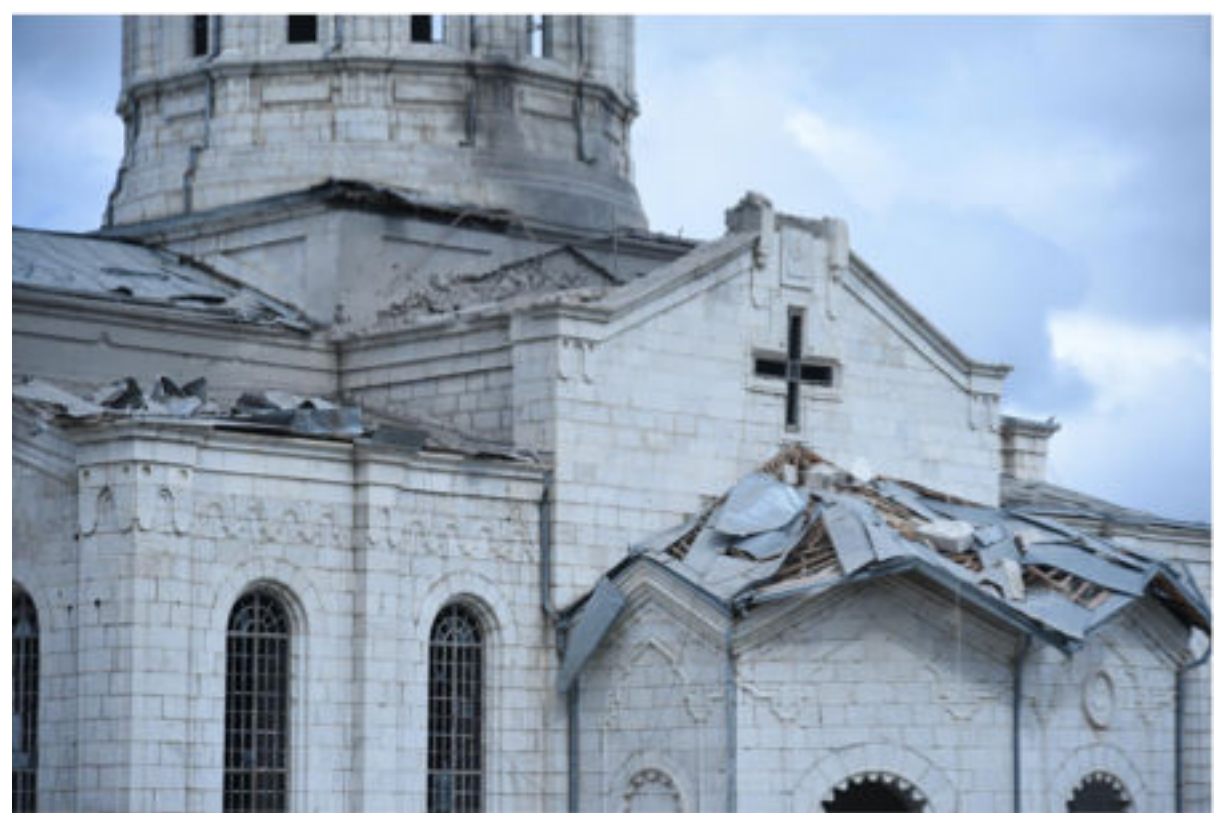
Some of the damage caused to Ghazanchetsots Cathedral in Shushi on 8 October 2020.

elderly civilians were in the basement sheltering from other attacks – and again at 16:30 – which injured three Russian journalists. According to Nagorno Karabakh's Human Rights Ombudsman, the destruction of the cathedral "can be considered a war crime and crime against humanity". He says the attacks demonstrate Azerbaijan's "intent to destroy the Armenian historical exceptional cultural heritage, humiliate Armenians by taking away its past, culture and heritage and kill peaceful residents and international journalists performing their professional duties." <sup>16</sup>