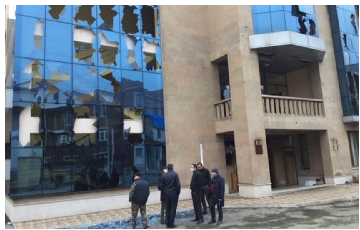
Stepanakert's School of Music, November 2020.

Between 1-3 October, BBC journalists in the capital city Stepanakert witnessed "random shelling... including at an emergency services centre [and] an apartment block destroyed. As people tried to flee, there was a drone overhead. Shortly afterwards, more shelling nearby." Journalists characterised the offensives as "indiscriminate shelling of a town without clear military targets." These reports were dismissed by President Aliyev as fake news.<sup>5</sup>