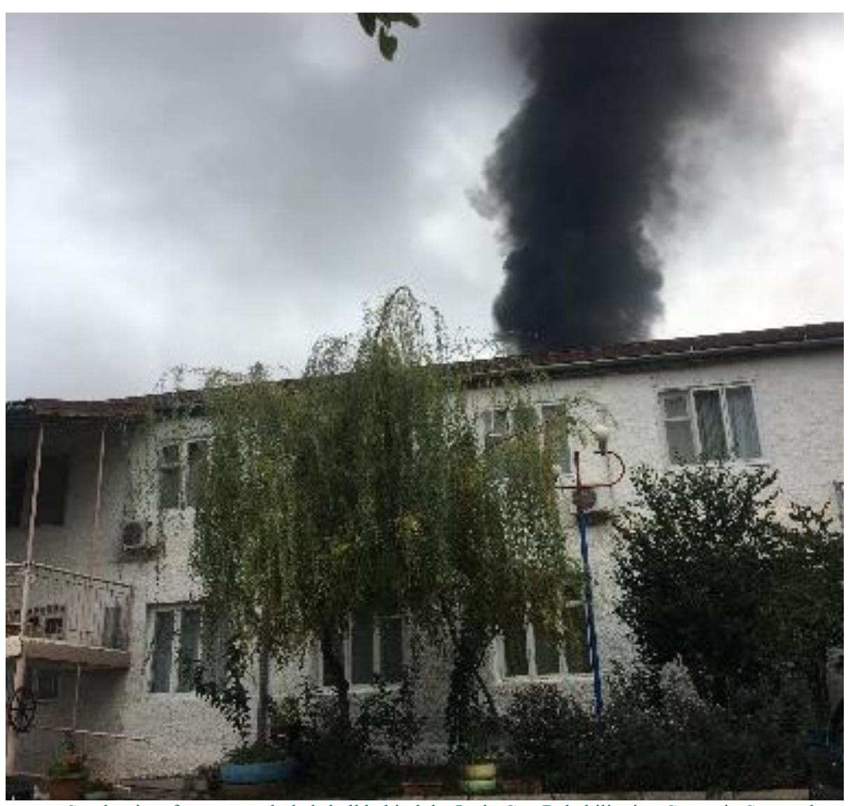
Smoke rises from an exploded shell behind the Lady Cox Rehabilitation Centre in Stepanakert.

The International Committee of the Red Cross (ICRC) has been present in the region since 1992. Among its current priorities are: food supplies for people displaced or returning home after displacement; and shelter support, including heating, repairs to buildings, hygiene facilities and clean water. The UN has promised to respond to these needs. However, the unrecognised status of Nagorno Karabakh remains a stumbling block to member states and to aid agencies. Azerbaijani officials insist that any visit of a foreign citizen, as well as "any kind of political, economic, financial, cultural and etc. interaction with [sic] illegal regime established there", is a "direct and crude violation of the sovereignty, territorial integrity and inviolability of borders of the Republic of Azerbaijan." Internationals who visit Nagorno Karabakh are therefore added to a "list of 'persona non grata' whose entry to the territory of the Republic of Azerbaijan is banned."