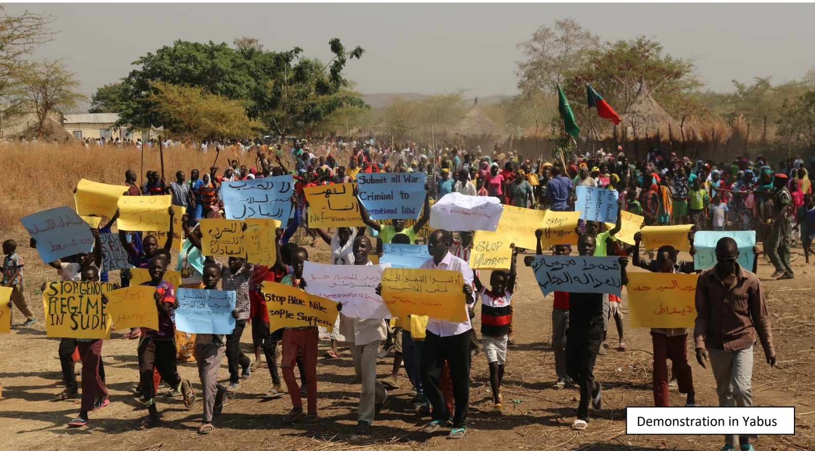
Demonstration in Yabus

GoS, particularly regarding self-determination or autonomy. Clashes occurred between the two factions, causing further displacement of civilians and increasing tensions among the local people. No dialogue has yet been arranged between Malik Agar and Abdul-Aziz Al-Hilu to try to settle the disagreement.