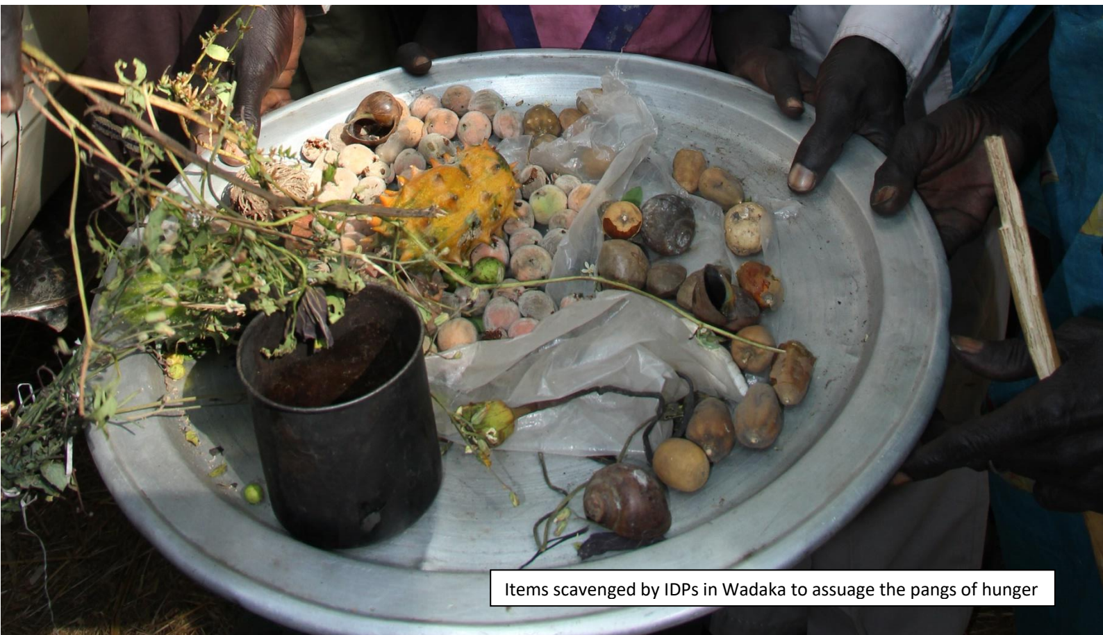
Items scavenged by IDPs in Wadaka to assuage the pangs of hunger

“In Danfona, our home area, we had everything including stored food, but it was all burnt. We lost everything. On the journey, some people were injured. Many children were lost in the bush as everybody woke up in disarray and ran. Until now many children are still missing and their families fear them dead as there is no news. They took all our cattle. We fled without anything. When we came here, there was nobody to help us, no NGOs. You are the first people to visit us.”