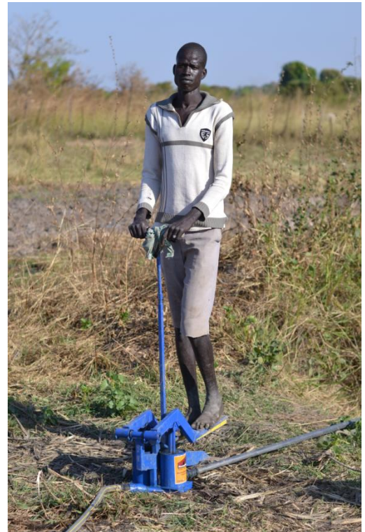
Above: A man near Wau operates a foot pump for water, purchased by the community without external support. Wherever we travelled we saw signs of inspiring human resilience in spite of the challenging circumstances.