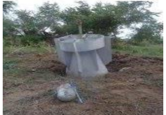
Above: 8 cluster bombs fell on the civilian area Umsirdiba, Umdorien County on 21 st and 26 th June 2015. Cluster munitions are indiscriminate weapons banned under the Convention on Cluster Munitions, that Sudan is yet to join. Cluster bombs scatter submunitions unpredictably over a wide area.

Due to the low level technology utilised by SAF, many bombs that fall on civilian areas do not explode. This has meant that the region has experienced almost daily incidences of children and animals being injured by unexploded bombs and missiles, which act as de facto mines. Close to Tobo, a 3m long unexploded missile is buried in the ground. It is not safe to go near and so the community is unable to access this area of land for cultivation. There are personnel who have been trained in de-mining. However, as there are no funds available for equipment they are unable to use this expertise.