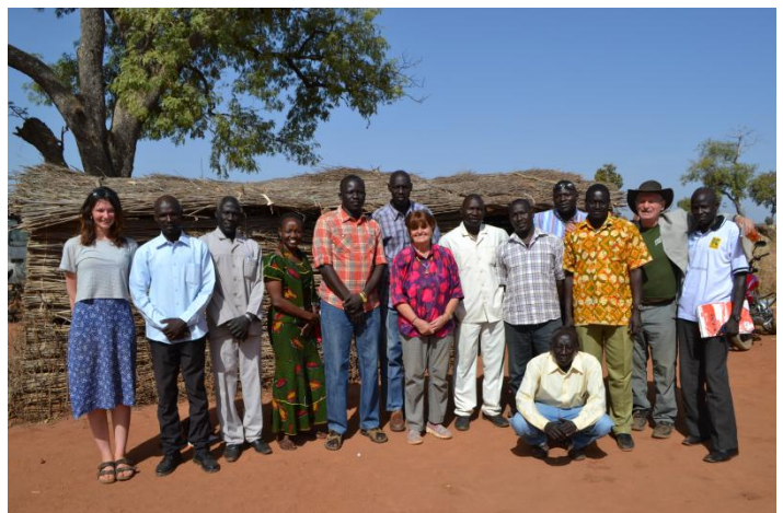
Above: The HART delegation met with the community-organised education office at Yida.