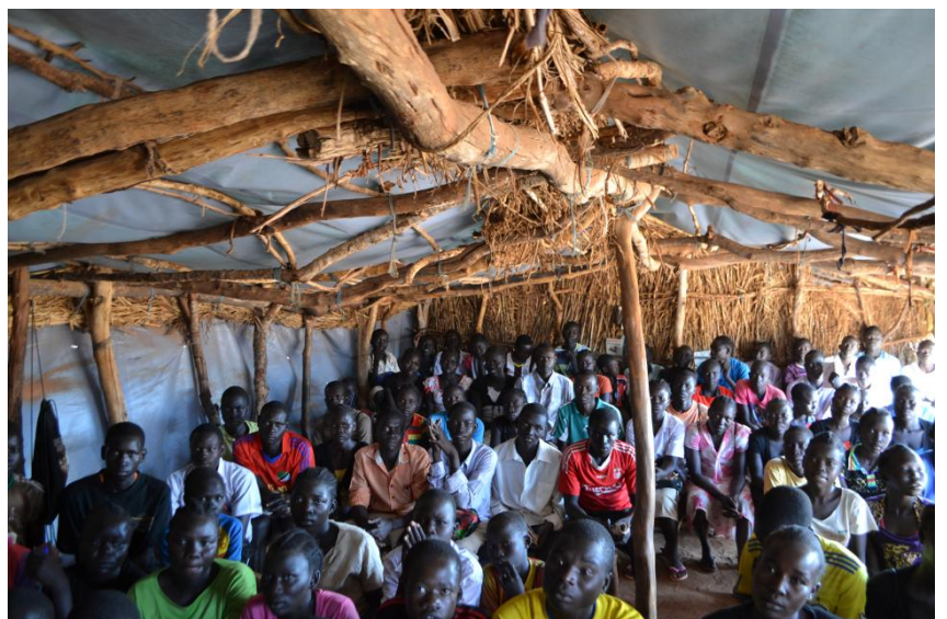
Above: Photograph showing pupils in class at one of the Primary Schools in Yida and the construction of the classroom.

It’s the second term, and we don’t have anything in our hands. Here we are following the curriculum of Kenya. Here we do not have textbooks, it’s not available, but in Kenya, you have available textbooks. Also, because of the environment of the school, you see some weeks a huge number of pupils in the market. When we ask them, they tell us, they don’t have exercise books, they don’t have pens. A very big number of students, they are in the market, the street. They need special treatment so we can support them and they can go back to their schools. Benjamin [HART’s partner] supplied us with some text books. We thank him very much.”