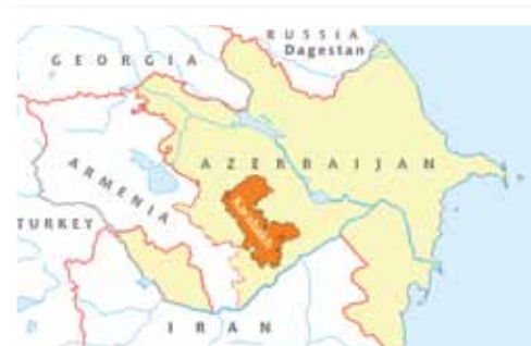
Left: Nagorno-Karabakh is an historically Armenian-populated enclave land-locked within Azerbaijan