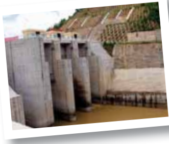
Above: The Shweli Hydropower Dam 1, located in Mantat village, northern Shan State

All of this is fuelling conflict as local people grow increasingly frustrated with the Government. The Global Witness pressure group has found links between the jade mining industry in Kachin State and fighting between the Army and ethnic Kachin soldiers. During HART’s visit to Burma in May, staff were told “The peace process is going backwards. There is still fighting in Shan, Kokang region, Kachin and Rakhine States. The peace process is not moving forward.”