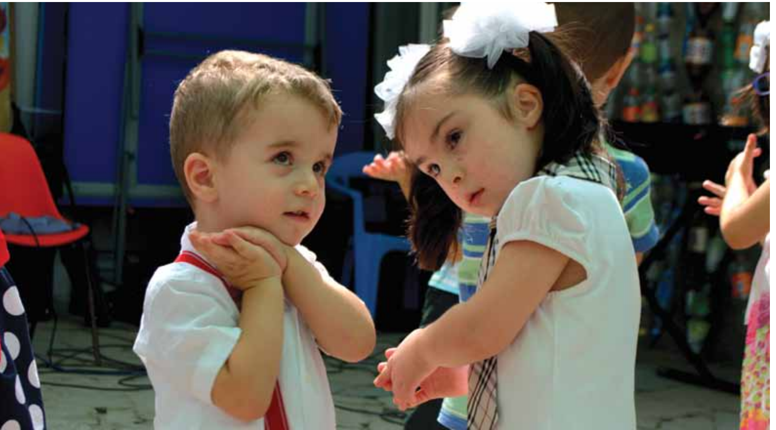
Above: Children play together at the Day Care Centre in Nagorno-Karabakh