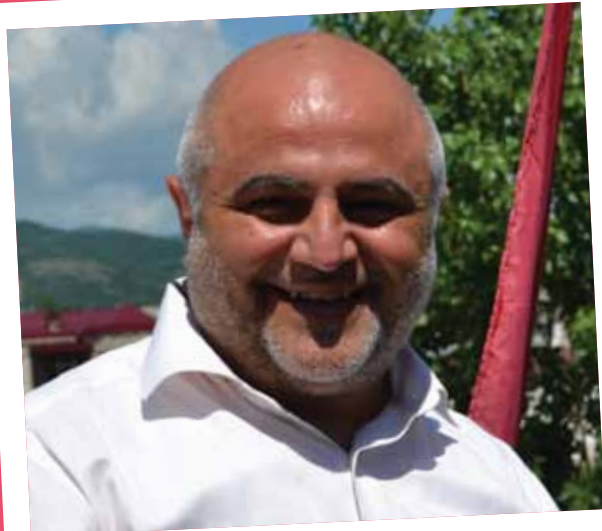
Director and Founder of The Lady Cox Rehabilitation Centre in Nagorno-Karabakh