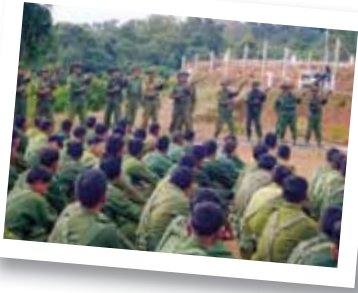
Left: Burma Army battalion sent to secure the Shweli Hydropower Dam 1