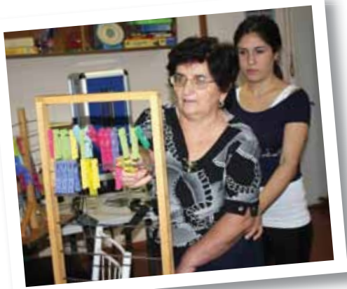
Above: Occupational Therapy

treatment, to learn new activities, experience a new way of life, prepare for new professions and reintegrate back into the community. I believe that we will see a lot of changes in my community because sometimes they still don't recognise people with disabilities. We will change the view of the community towards people with disabilities and families won't feel any shame that they have a relative with disabilities.