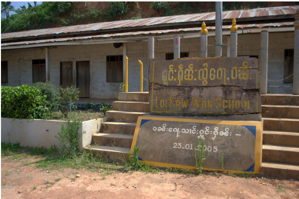
Above: The school building at Loi Kaw Wan camp where there are 200 students. There are 16 members of staff, including 12 teachers.

SWAN and Shan State Development Fund (SSDF) support the school in a small way, but this contribution is not enough for the resources that they require and staff wages. They urgently request new donors to fund education. The people in the camp place great value on education. They do not know when or if they will be able to return to their homes so they want to equip young people with skills and knowledge for their uncertain future.