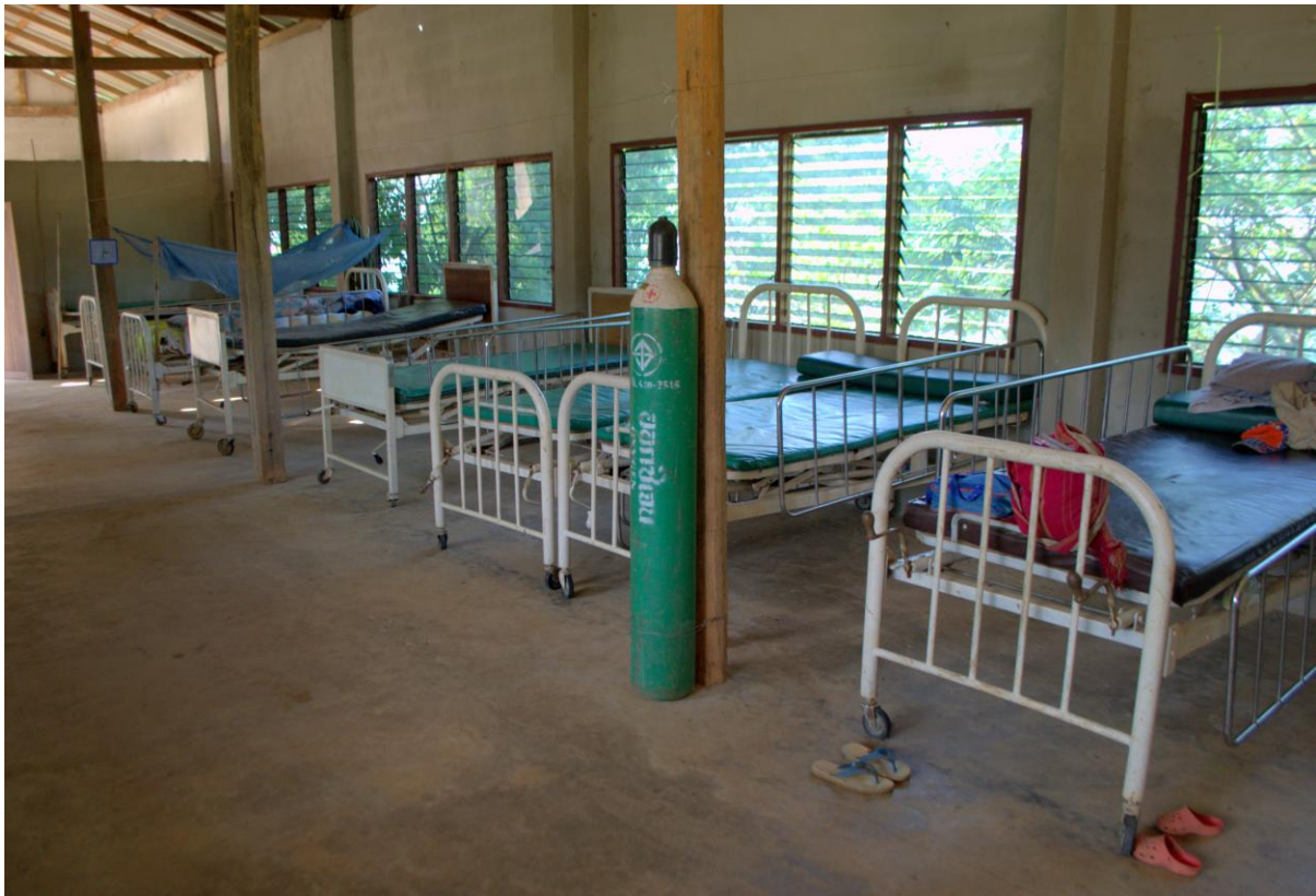
Above: the ward at Loi Kaw Wan camp clinic. The clinic sees 15 – 20 patients per day or 200 – 250 per month.

Like many other projects that we saw on this visit, the clinic at Loi Kaw Wa camp is losing donors. Four years ago the project received 100,000 THB per month. It now receives 60,000 THB per month and this looks to be decreasing.