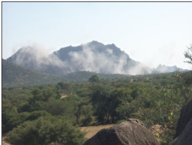
Bombings of Adouna Village, Delami County. Nov 6th 2014. (Sourced from an April 2015 Report by the International Refugee Rights Initiative and National Human Rights Monitoring Organisation)

Sudan is just one example of the devastating impact the international arms trade can have on human rights and development, fuelling conflict and insecurity. The military-industrial complex puts profit over people as governments turn to arms exports in a time of austerity and economic uncertainty, propping up oppressive regimes in the process. It's up to us to put pressure on government and big business to end their political and economic support for the deadly arms trade. The Campaign Against Arms Trade (CAAT) is one such organisation attempting to do this, working in the UK as it campaigns against the global arms trade by promoting a boycott and divestment strategy. They provide a lot of information detailing the intricacies of the arms trade while also highlighting the ways we can get involved in the disarmament campaign, all of which can be found here on their website.