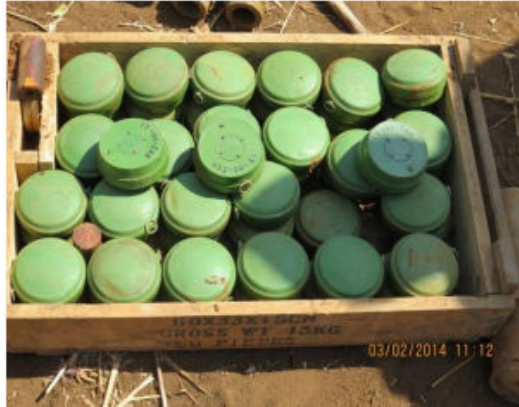
Chinese-made T 72A anti-personnel landmines. (Sudan Consortium Human Rights Report, March 2014)

In selling arms to Sudan, China has gone to great lengths to contravene international efforts to sanction the al-Bashir regime, but why?