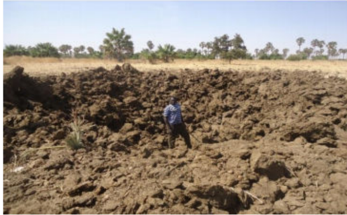
Russian S-8 Air to Surface Rockets causing serious damage in South Kordofan (Sudan Consortium Report, February 2014)