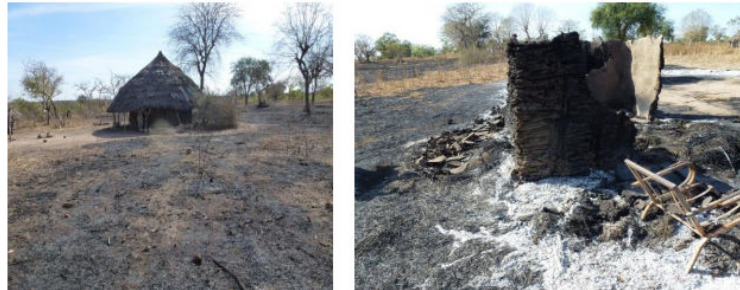
The aftermath of an Antonov bombing attack on Mayak Village, Blue Nile, 20 March 2014 (Sudan Consortium Human Rights Report, March 2014)