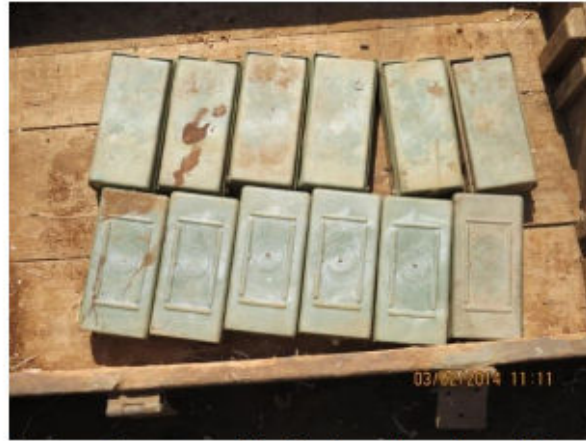
No 4 anti-personnel land-mines (Israeli-made)