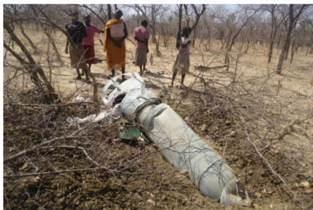
Unexploded Russian-made FAB 500 (Parachute Bomb) dropped on Ekpol village, Southern Kordofan, 13/02/2014 (Sudan Consortium Report, February 2014)