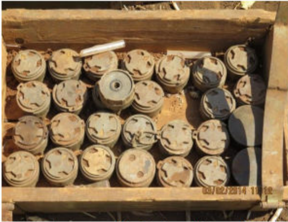
M14 anti-personnel land-mines (US-made)

embargoes on both countries. Conversely, it can be counter-argued that these were first sold to “legitimate” regimes, not under international sanctions, who then went on to sell the western-made weapons to Iran or Sudan. However, this at least suggests a problem with the supply chain, in which the global trade of conventional weapons, such as AK47s, have fewer regulations than bananas and will boost calls for tougher regulations.