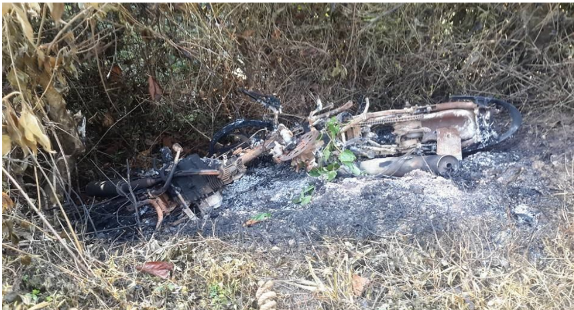
Motorcycles burned by Burma Army troops after killing two villagers on road to Murng Yai on Oct 3, 2014

The two men were riding their motorcycles on the road from Wan Boong village to Murng Yai to buy buffaloes when they were shot at by Burmese troops near Loi Kio Jee. After they were killed, the Burmese troops set fire to the motorcycles.