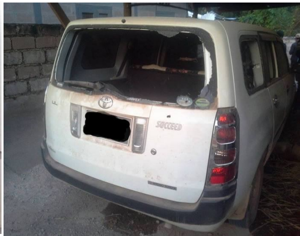
A car which was damaged by Burmese shrapnel