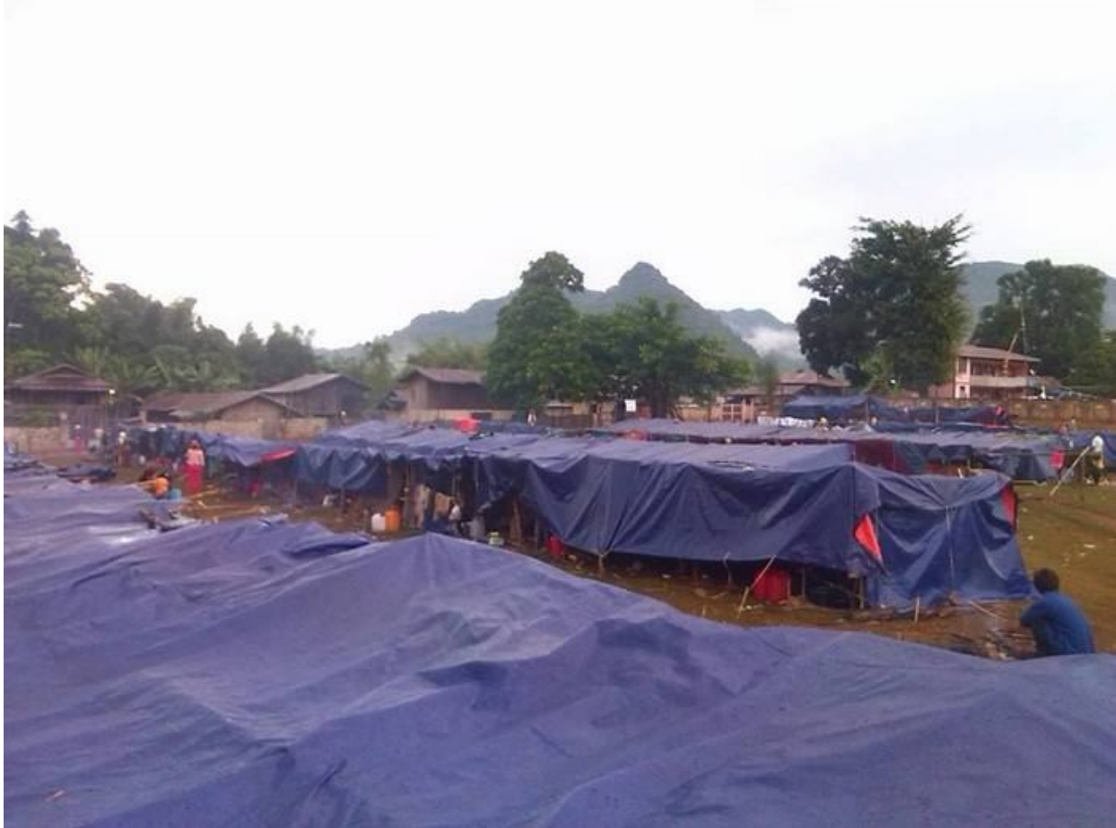
IDP camp at Hai Pa Temple, Mong Hsu township

This attack has caused the entire civilian population of Wan Hai, about 2,000 people, to flee from their homes and seek refuge in nearby villages and towns. Together with ongoing displacement from other areas, this brings the total number displaced by the current offensive to over 6,000. These displaced have had to abandon their homes and farms, and are in dire humanitarian need. 14 schools have been forced to close, with over 1,250 children unable to attend classes. Since November 1, 2015, the Burma Army has blocked all vehicles and people from accessing Hai Pa IDP camp.