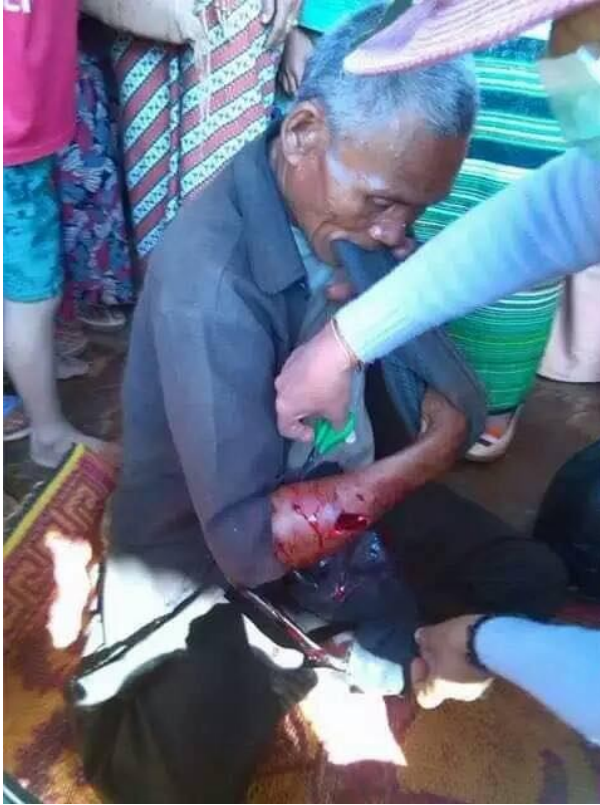
Loong Boi, who was shot by Burmese troops